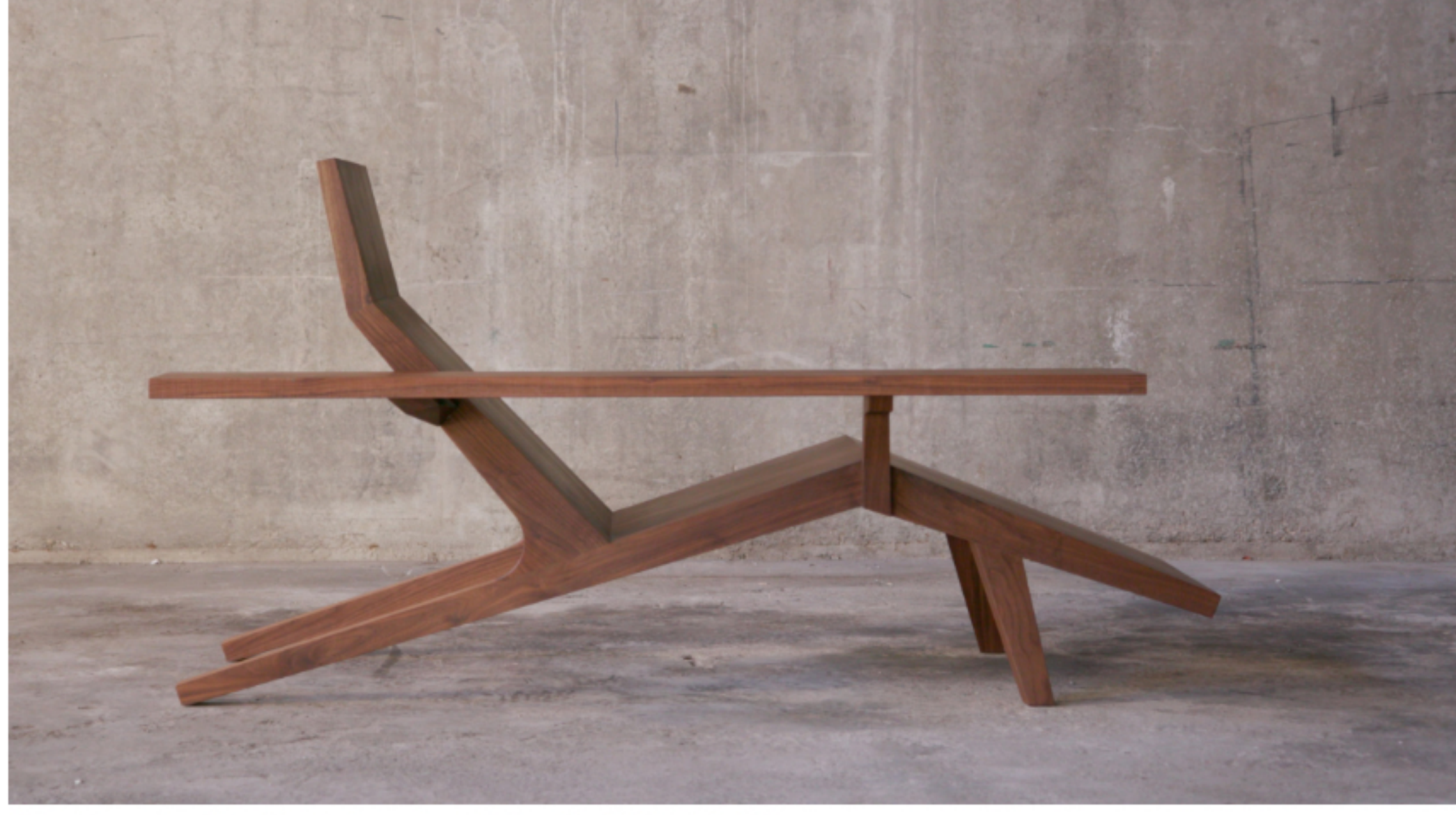
Moooi launched the Liberty Lounger at Milan Design Week 2018

The product originated from a series of artworks titled New Tribal Labyrinth , in which Van Lieshout "tried to re-invent the industrial revolution" by imagining a future society where everyone is involved in the process of production.