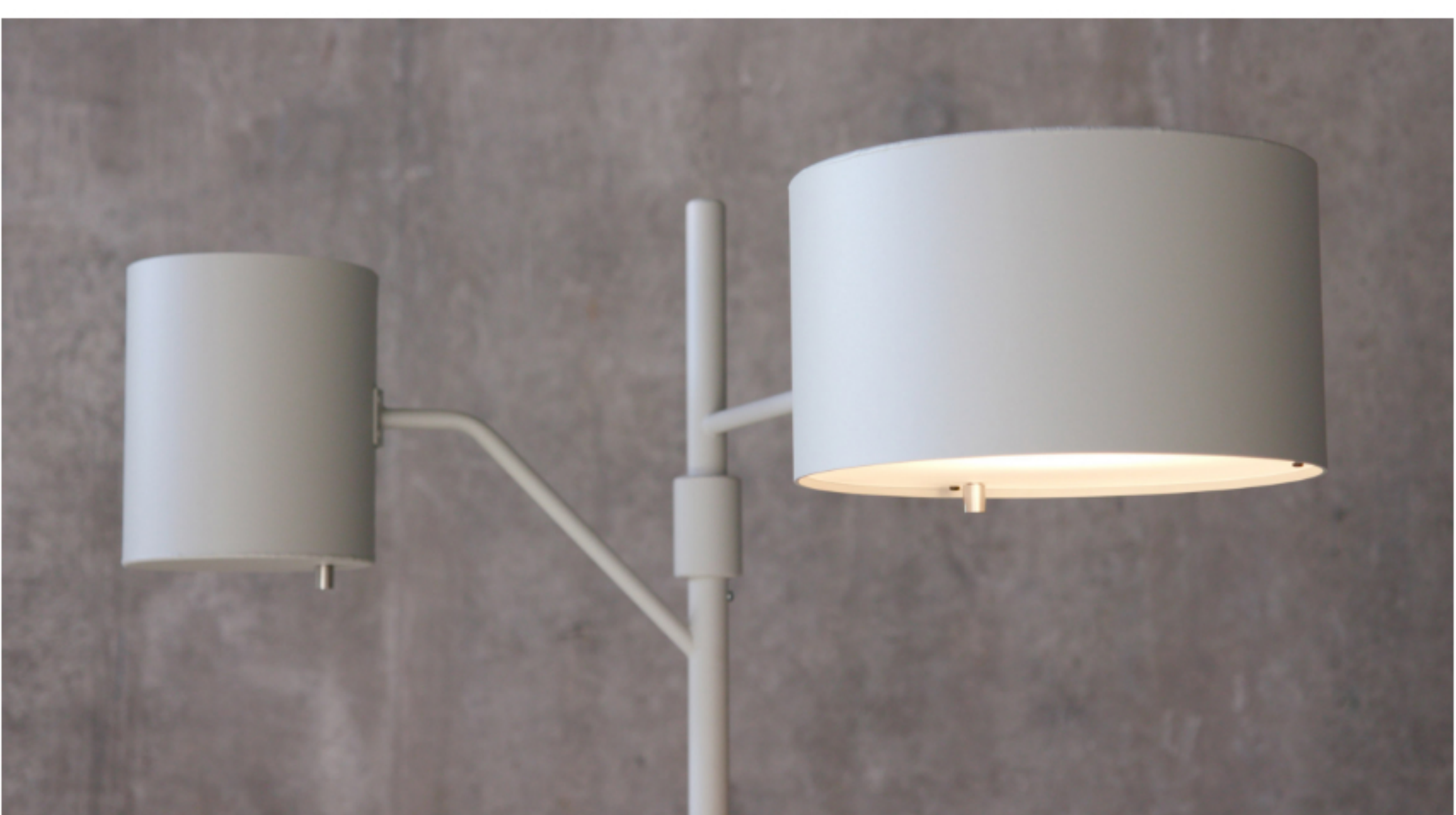
The Statistocrat lamp by Atelier Van Lieshout has cylindrical metal lampshades that branch off from a central pole

"The Statistocrat lamp was inspired by the diet of the slaves," he explained. "I translated those quantities into charts."