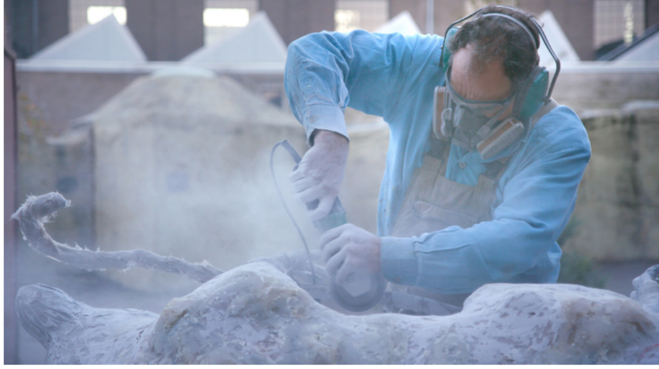
Joep van Lieshout runs his studio Atelier Van Lieshout from a warehouse in Rotterdam

The studio produces a wide range of work, from large-scale art installations and sculptures, to individual products, such as the Liberty Lounger chair and Statistocrat lamp for design brand Moooi.