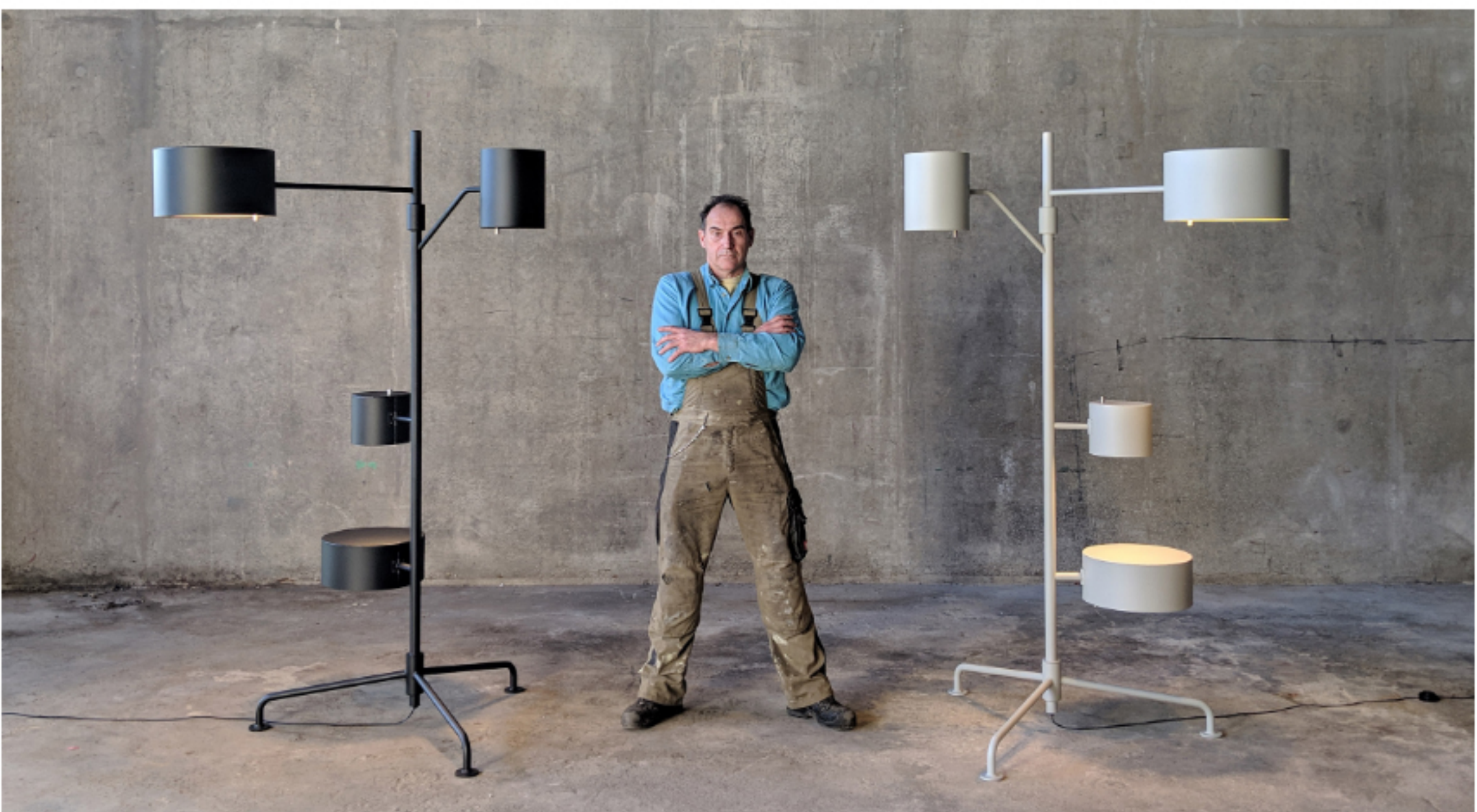
Moooi launched the Statistocrat lamp during Milan Design Week 2015

"I really love working with Marcel [Wanders] because he is crazy enough to make renegade decisions. I don't like very long processes. A piece of furniture should come from the heart and then you smash it into the world."