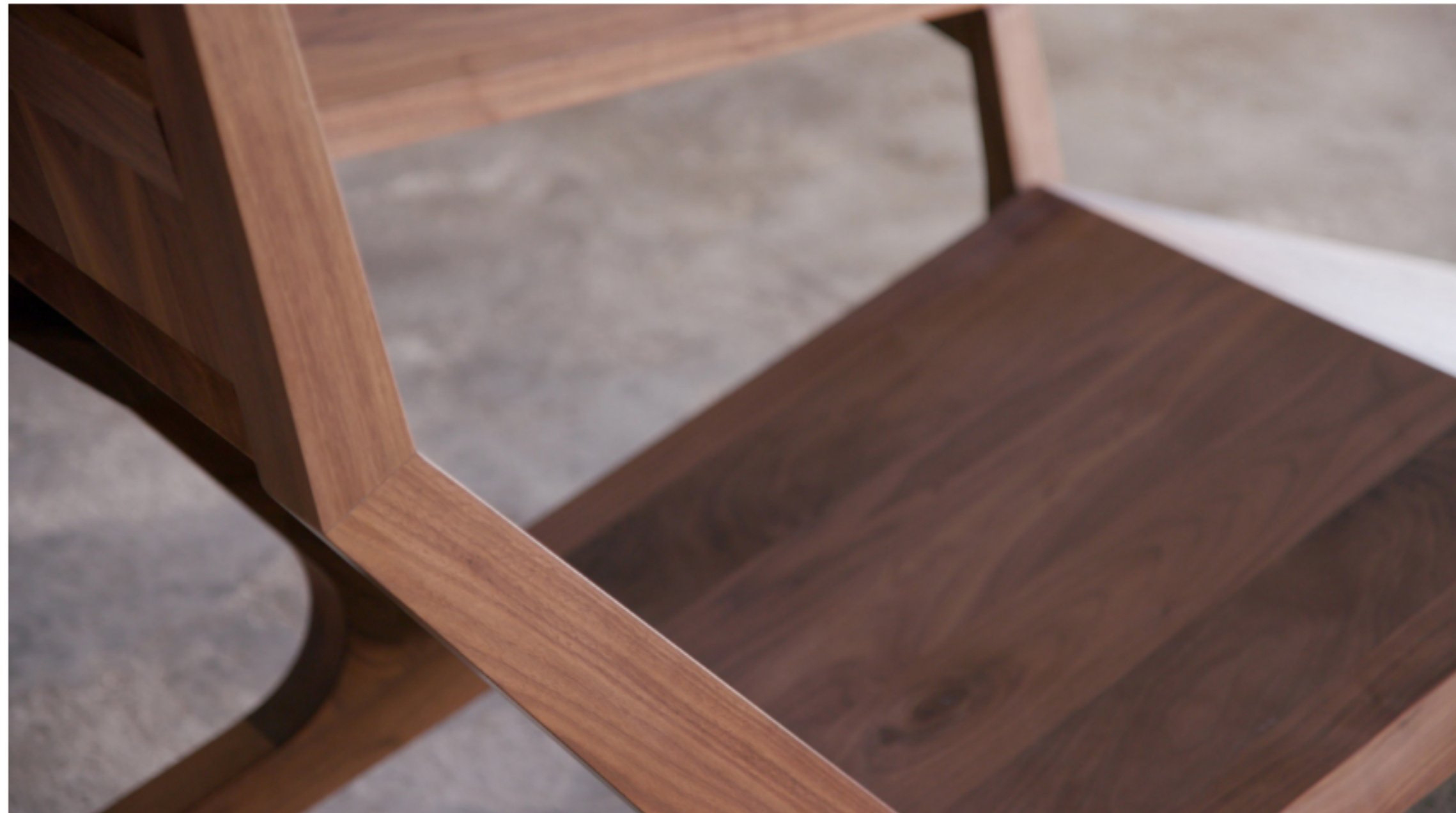
Moooi's Liberty Lounger chair is made from American walnut wood